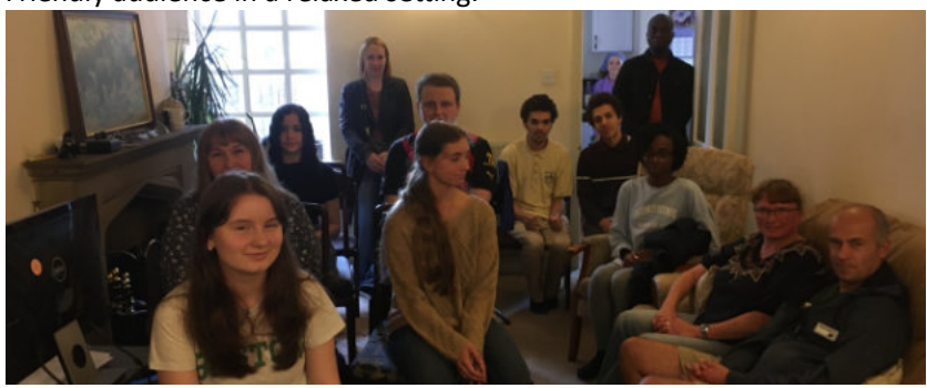
Friendly audience in a relaxed setting.

Worleston Village Hall during term time and is open to anyone in the community. If you are interested in any of these activities, please contact Andrew on 07985782085 or via the website WmusicS.com.