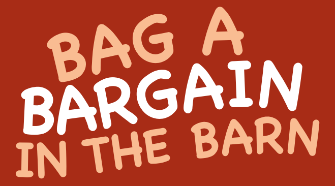
Table Top Sale and Family Fun in the farmyard. Come and support a number of Local Charities. Games and refreshments.