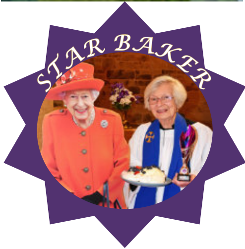
See Isobel's Winning Recipe on Page 17