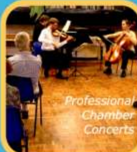
Professional Chamber Concerts