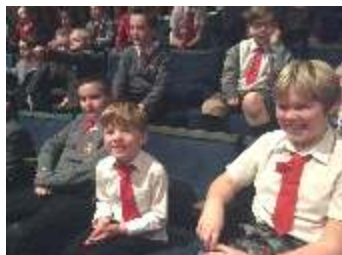
Our whole school trip to see the production of Wind in the Willows at the New Vic Theatre in Stoke on Tuesday 27th November.